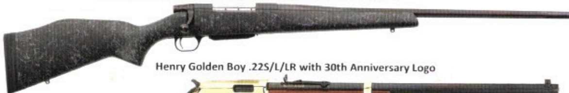
Henry Golden Boy .22S/L/LR with 30th Anniversary Logo